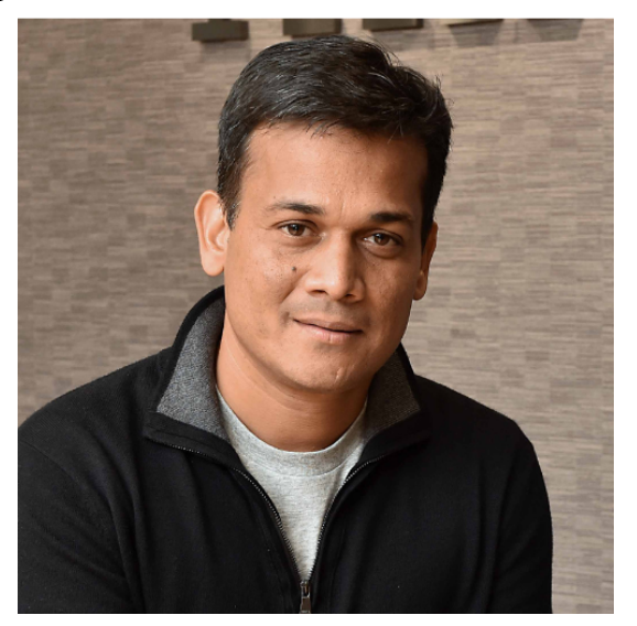
The MPC Show Times